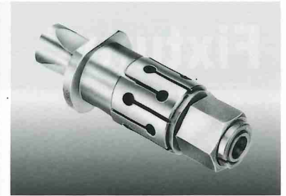
Short series [ 7000 type ]