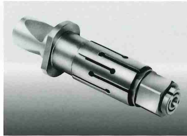
Standard series [ 1000 type ]

These models are suitable for grinding operation by supporting the Between Centers of machine after clamping the reference I.D. of the work-piece.